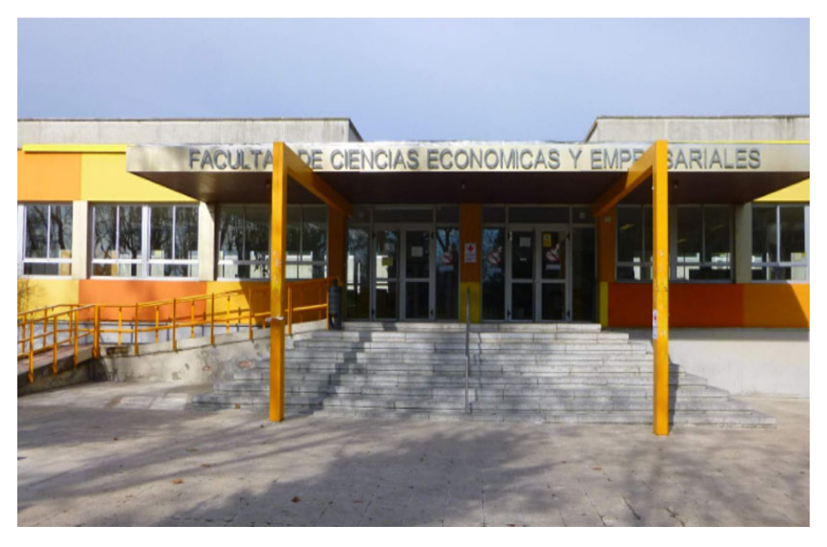
Main entrance Faculty of Business and Economics