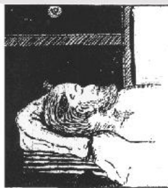
THE MURDERED MAN.

Sketched from flashlight photograph of the dead man now in possession of the county attorney. The sharp edge of the instrument laid the skull open. The mark near the eye was caused by blunt portion. Other newspapers tried to obtain access to this photograph but failed.