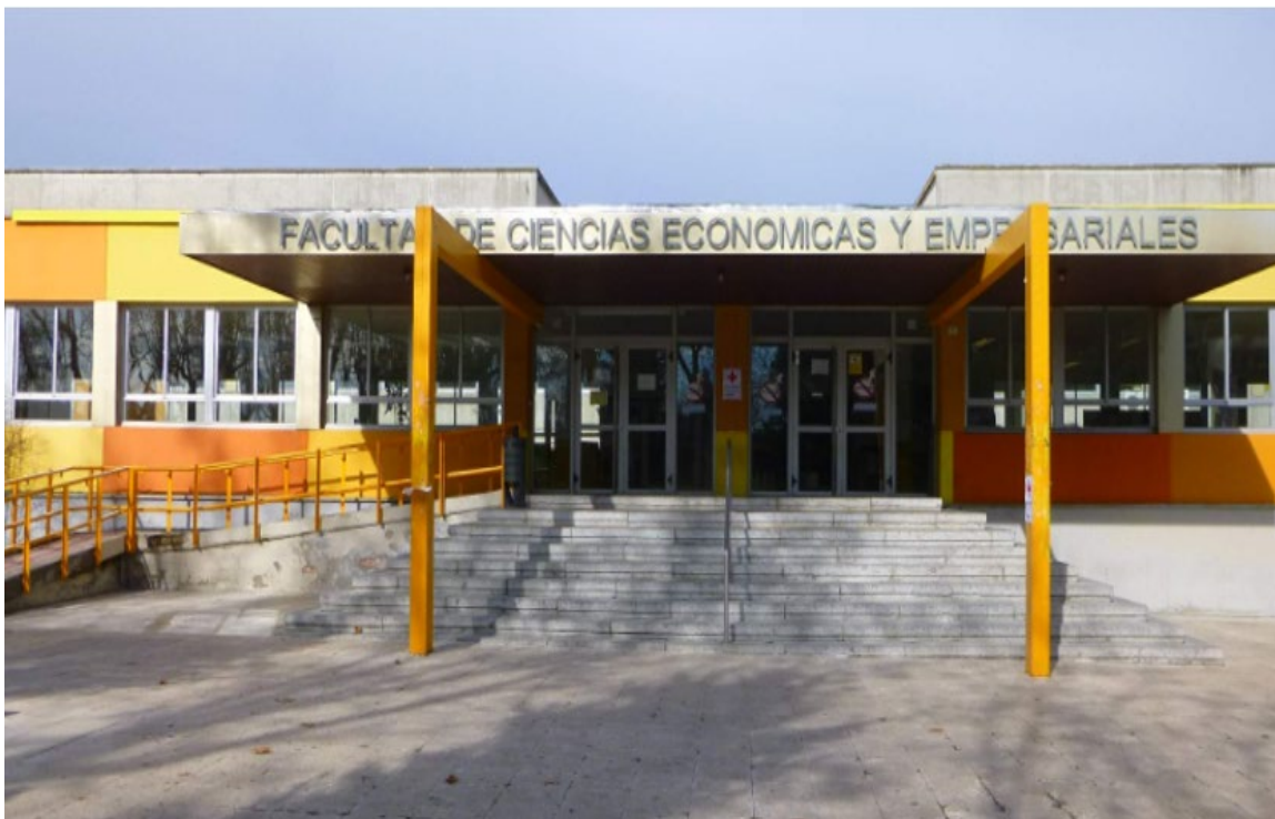
Main entrance Faculty of Business and Economics