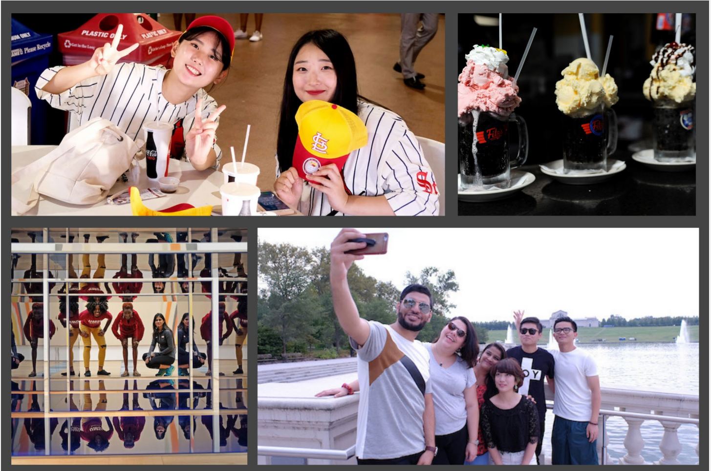
Enjoy the many free attractions in STL like the St. Louis Art Museum (bottom left). Explore Forest Park (bottom right), try Fitz’s famous root beer floats on the Delmar Loop (top right), or check out a Cardinals game (top left). It is all a Metro ride away!